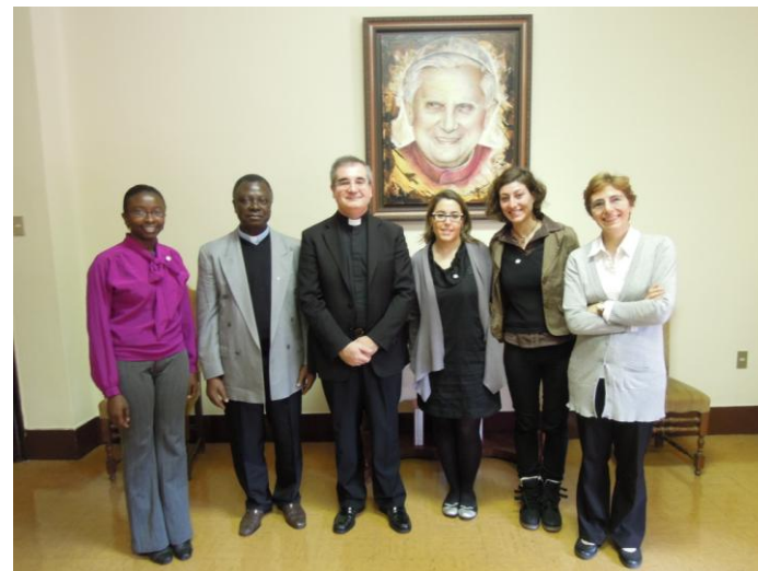
Meeting with Mgr Delgado, the Under Secretary of the Pontifical Council for the Laity

The main areas of address were to introduce the new IS team, report on the outcome of the 2012 International Congress held in Alton United Kingdom, report on the different activities undertaken by the National Movements and share the program of activities.