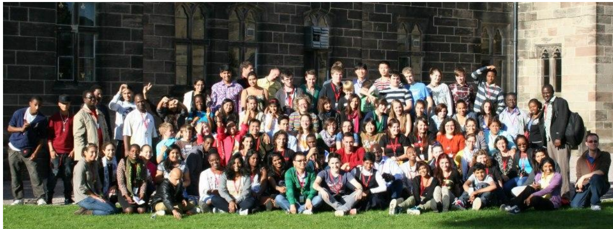
Some of the participants at the 8 th International Congress