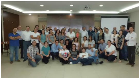
Leaders and chaplains of YCW Dubai at training session