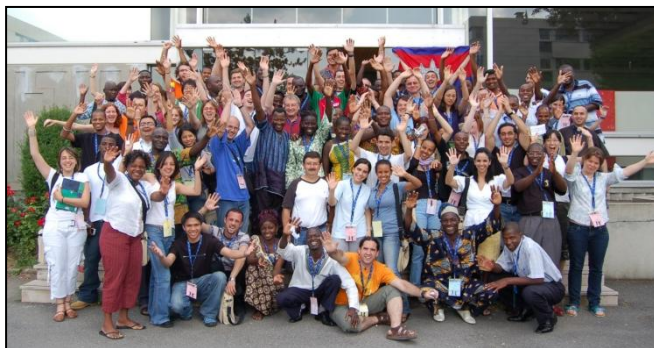
Some of the participants at the 7 th International Congress

We're seeking your support for the 8 th ICYCW International Congress!