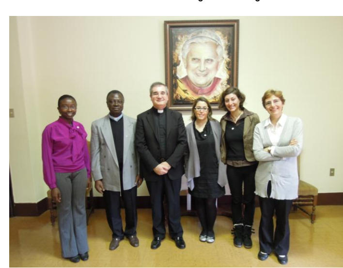
Meeting with Mgr Delgado, the Under Secretary of the Pontifical Council for the Laity

The main areas of address were to introduce the new IS team, report on the outcome of the 2012 International Congress held in Alton United Kingdom, report on the different activities undertaken by the National Movements and share the program of activities.